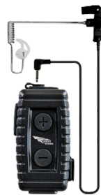
Bluetooth ® PTT & Earpiece