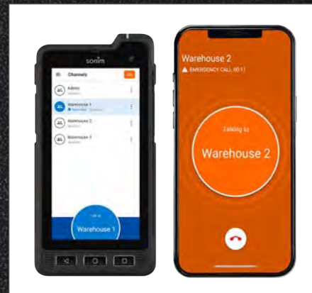
Tait PTTToX application available for Android and iOS smart devices.