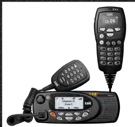
TAIT AXIOM Mobile provides a choice of vehicle installation and user interface options.