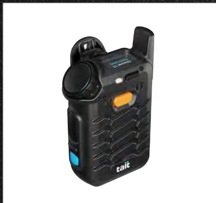
TAIT AXIOM Wearable is a compact, ruggedized, device for heads up communication.