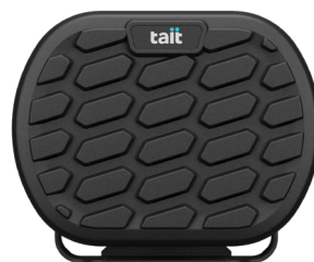
Rugged External Speaker