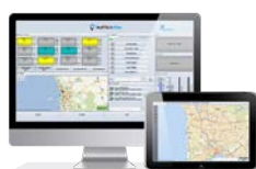
Dispatch & Mapping