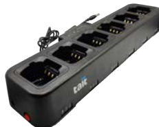
6 Bay Charger