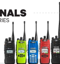
TP9000 Portable Radios