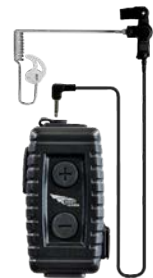
Bluetooth® PTT & Earpiece