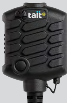
TSM4 IS Remote Speaker Microphone