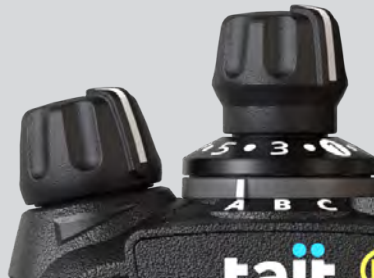
Ergonomic, user-friendly controls