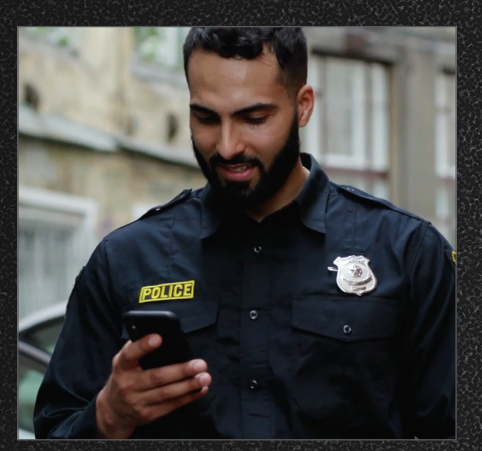
Officers can upload evidence from a WiFi device through the vehicle's LTE connection.