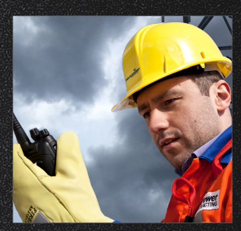
Utility workers can automatically be alerted to advancing lightning storms.