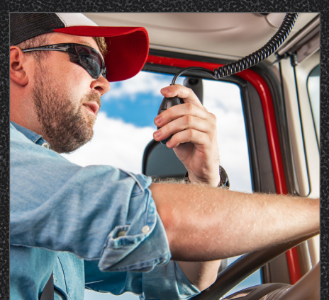
Transport drivers can use broadband to stay in touch with dispatch through radio dead zones.