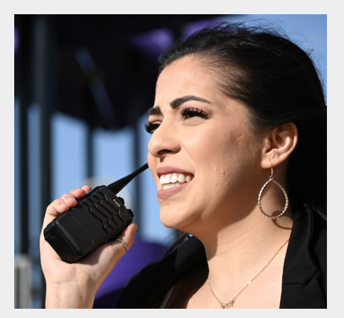
School staff members operate cost-effectively using direct mode communications.

The Tait TP2210 DMR Tier 2 portable radio combines affordability with operational simplicity, making it a solid investment for your business.