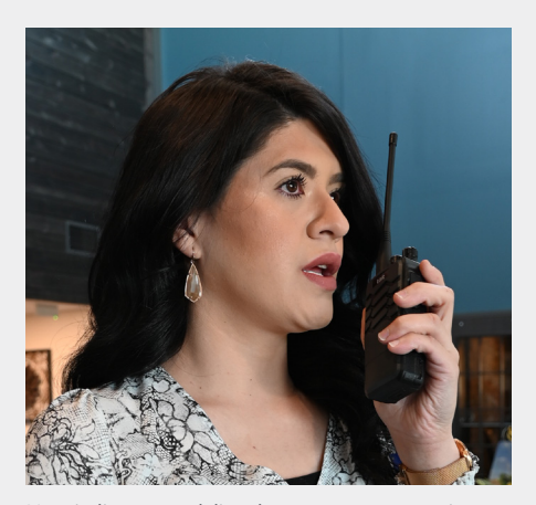
Hospitality teams deliver better customer service when communicating efficiently.