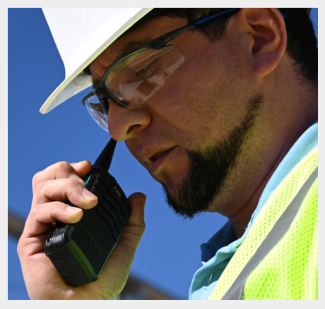
Construction crews hear instructions loud and clear using digital DMR technology.